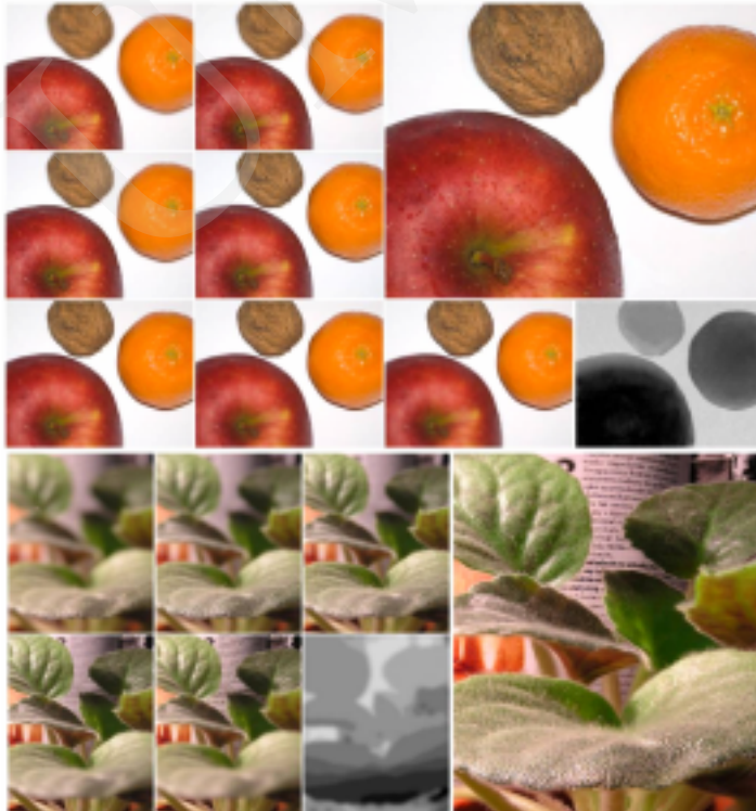
Fig. 3. Multifocus Image Fusion example sets. Small images are part of the original multifocus image set; last small, blurred image is the Height Map; large image is the fused image