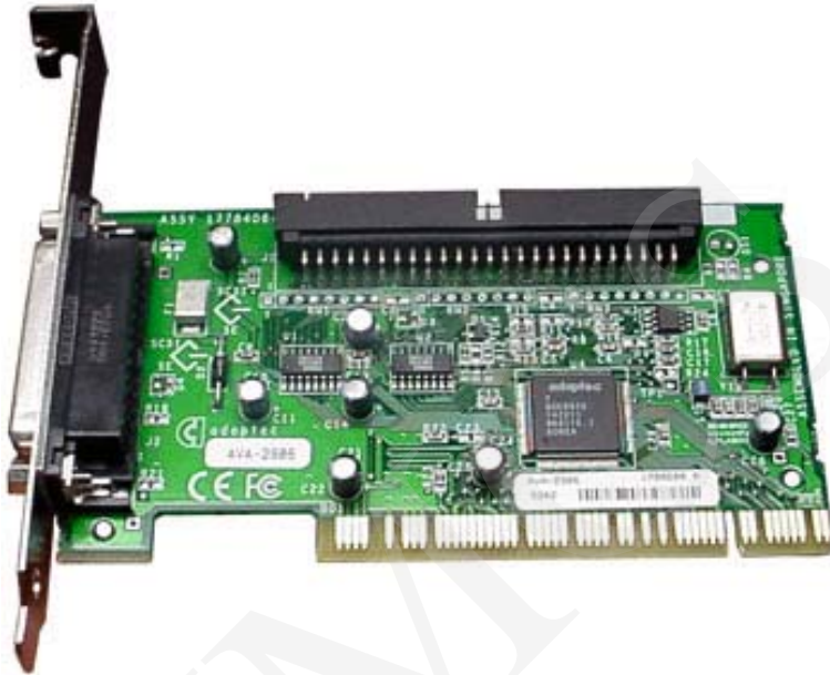
Fig. 2. Adaptec AVA 2906 controller.

For practical reasons (good quality development tools and documentation without restrictive license limits), our work is carried out in the GNU/Linux operation system environment with the application of a gcc compiler.