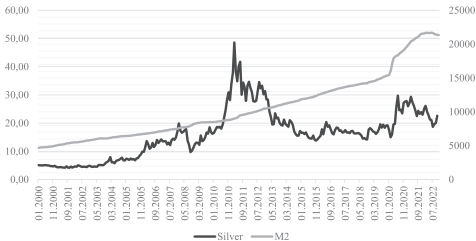
Figure 2. Silver price and USD supply measured by M2

In the case of silver market analysis, another indicator that may be important in determining the impact of external and non-market factors on its price is the money supply as measured by aggregate M2 (cash in circulation and deposits) in the United States (Figure 2).