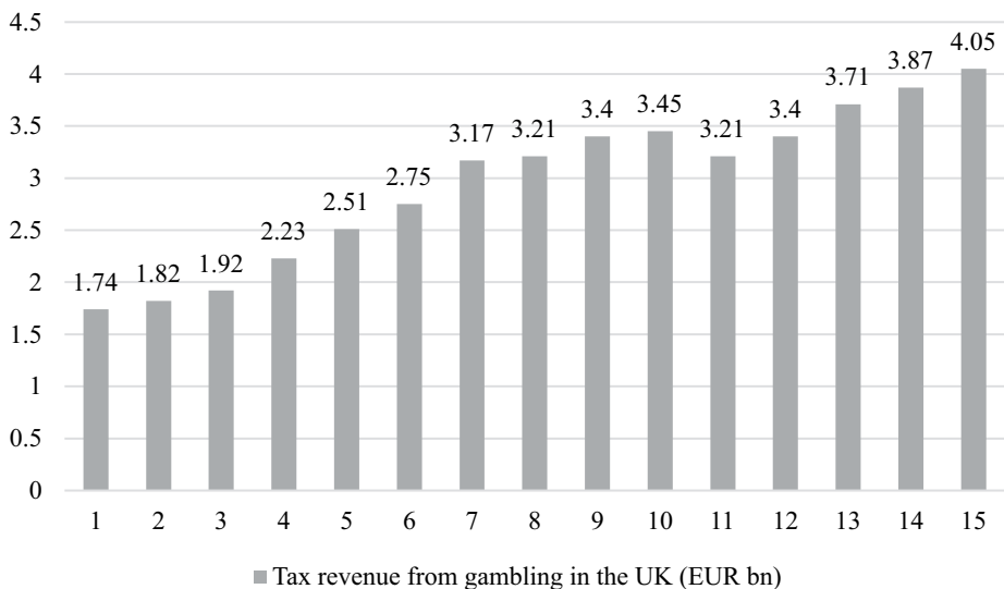
Figure 4. UK's tax revenue from gambling 2010–2024