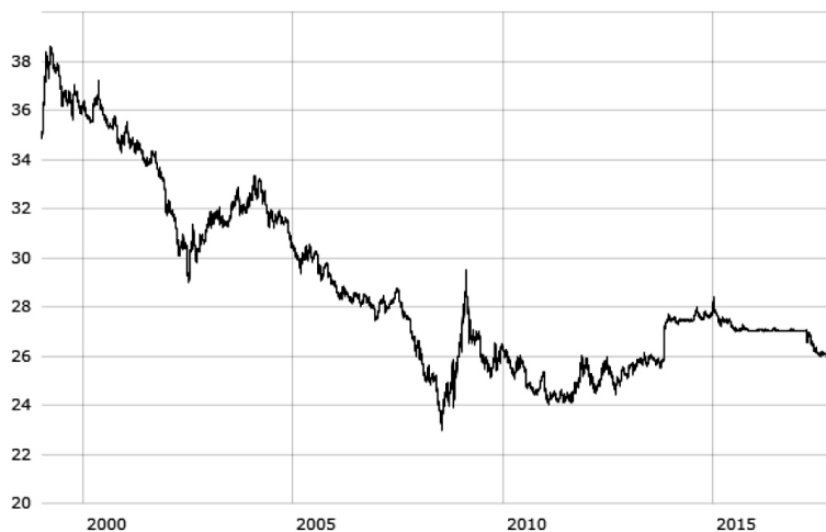
Figure 3. Fluctuations in the crown's rate in relationship to the euro, 2000–2017