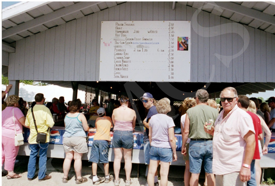
Figure 8. Food Concessions at Pulaski Polka Days, 2004.

Duck's Blood Soup], a dish virtually unknown in contemporary Poland (even absent from Polish dictionaries) but a classic for late nineteenth century émigrés from the Prussian partition of Poland. Five generations later, Polishness means Czarnina .