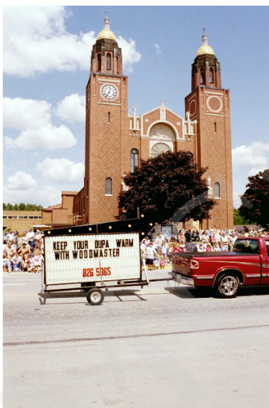
Figure 10. Polish American linguistic capital on display in the Pulaski Polka Parade, 2004.