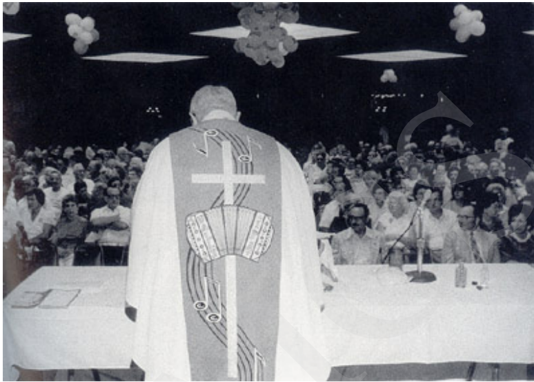
Figure 3. Priestly vestments at the International Polka Association's Polka Mass, 1983.