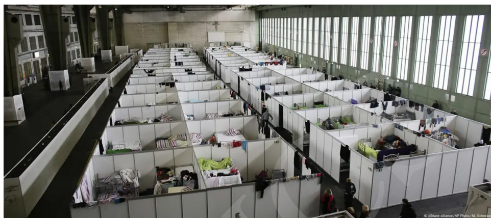
Picture: the refugee accommodation in the hangar of the airport Berlin Tempelhof, 2016

https://www.dw.com/en/berlin-to-stop-housing-refugees-in-tempelhof-hangars-in-theory/a-19415068