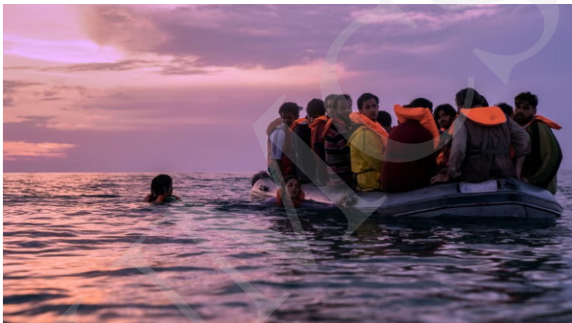
Picture: Yusra and Sarah swimming next to the sinking rubber dinghy, “The Swimmers”, 2022

It’s not a big surprise that all of our respondents mentioned the ‘boat scene’; the moment when the big group of “desperate and scared” refugees sits together in a small dinghy and the situation gets more and more dangerous from one moment to another. Many respondents were particularly scared by the huge level of uncertainty that the flight over the sea brings. The worries don’t end with the uncertainty though; the difficulties and unexpected, fatal happenings, such as “when the engine went out” caused many of the passengers to lose hope in the movie as well.