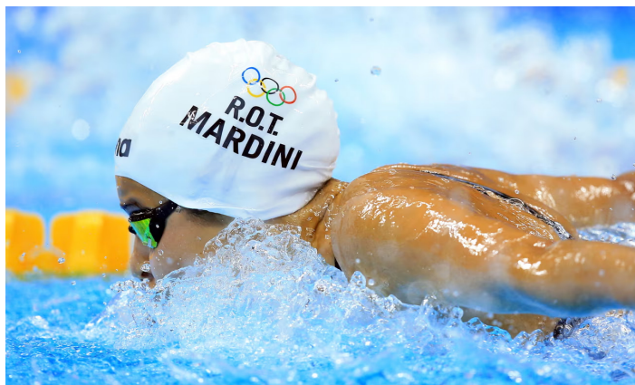
Picture: Yusra Mardini swimming for the Refugee Olympic Team (R.O.T.) at the Olympics in Rio de Janeiro, 2016

https://www.theguardian.com/world/2017/mar/17/yusra-mardini-syrian-refugee-and-olympic-swimmer-inspires-film#img-1