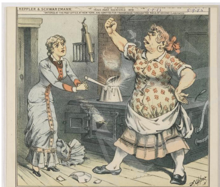
Figure 7. An overbearing Irish maid ( Puck , 1883)